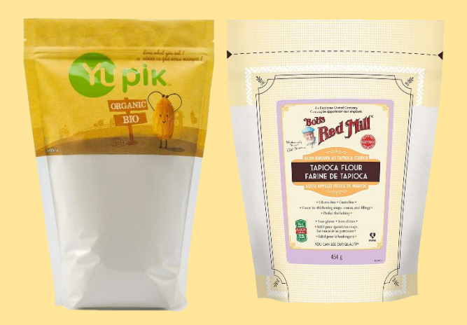
Two brands Vanessa recommends: Yupik and Bob's Red Mill Tapioca Flour/Starch

The listed ingredients yield above fifty 1 tablespoon-sized cheese balls.