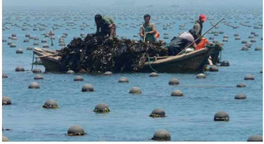
Large-scale kelp cultivation in Sungo Bay, China, is integrated with the cultivation of oysters, scallops, abalones and sea cucumbers.

Seaweed Cultivation, Integrated Multi-Trophic Aquaculture, Integrated Sequential Biorefineries