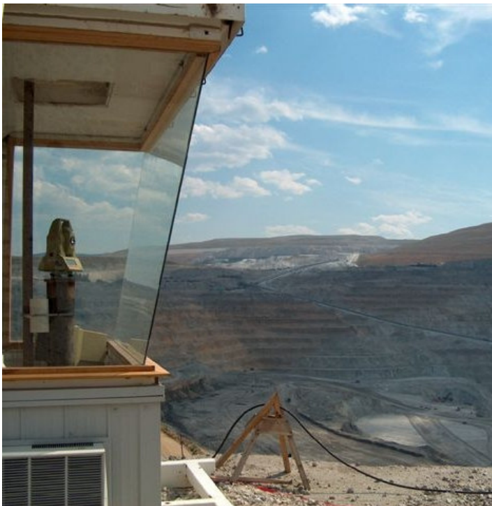
Fig 1 Typical view from an RTS shelter

The SA copper mining operation consists of several open pit mines at an elevation of approximately 3000 m above sea level. The largest of these pits has approximate dimensions of 2.5 km x 3.5 km (at the rim) with a depth of 1000 m. The area is very arid, with very predictable weather conditions of more than 300 sun days per year with an annual temperature ranges of about 3 0 C to 28 0 C with maximum day/night differences of about 15C 0 . The monitoring system at this pit consists of several RTS instruments (Leica TCA 1800, TCA 2003, and TCA 1201) located at strategic locations on the rim and at various elevations within the pit. All of these instruments are connected, controlled, and supported by the ALERT software system.